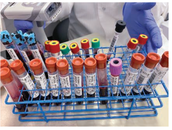
Blood drawn from Brianne Dressen, who suffered complications after a coronavirus vaccine, is part of a National Institutes of Health study.

The NIH researchers were "trying to help people," says a health care worker whose symptoms began after the Pfizer vaccine, one of four people in the study who spoke to Science . Nath says 34 people were enrolled in the protocol, 14 of whom spent time at NIH; the other 20 shipped their blood samples and in some cases cerebrospinal fluid.